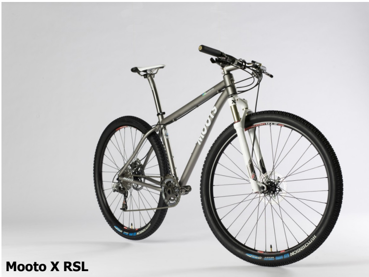
Mooto X RSL